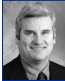
Rep. Tom Emmer R-Delano (19B) 2nd award